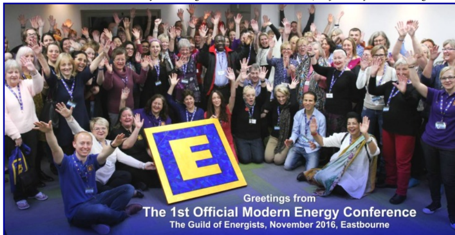
Greetings from The 1st Official Modern Energy Conference The Guild of Energists, November 2016, Eastbourne